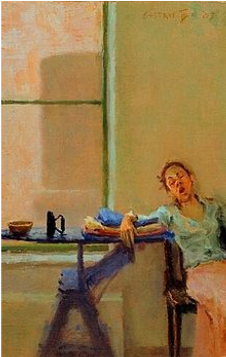
Yawning (Curtain Cleaner) by Gustave Blache III, 2003