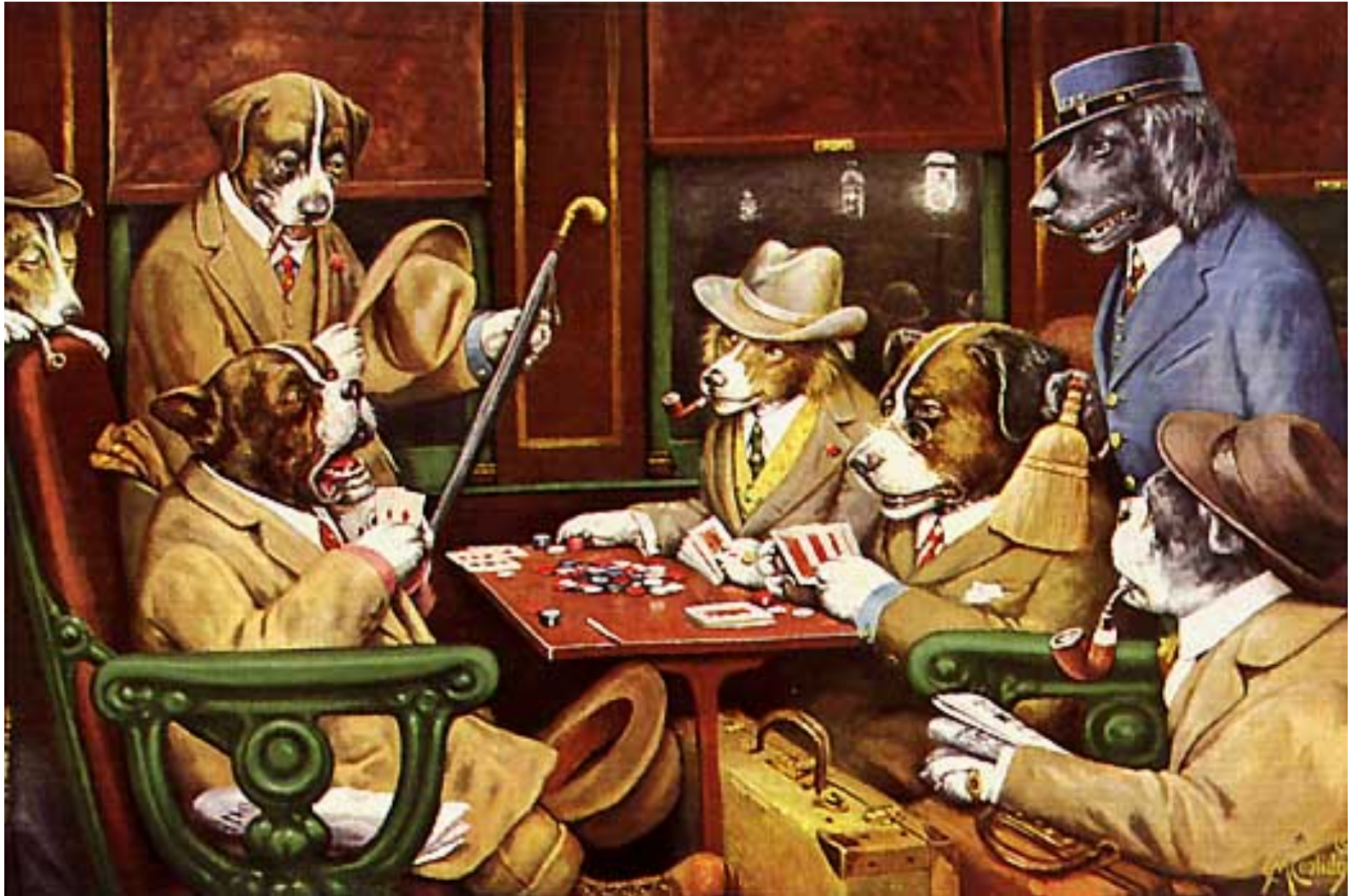
His Station and Four Aces by C.M. Coolidge, 1903