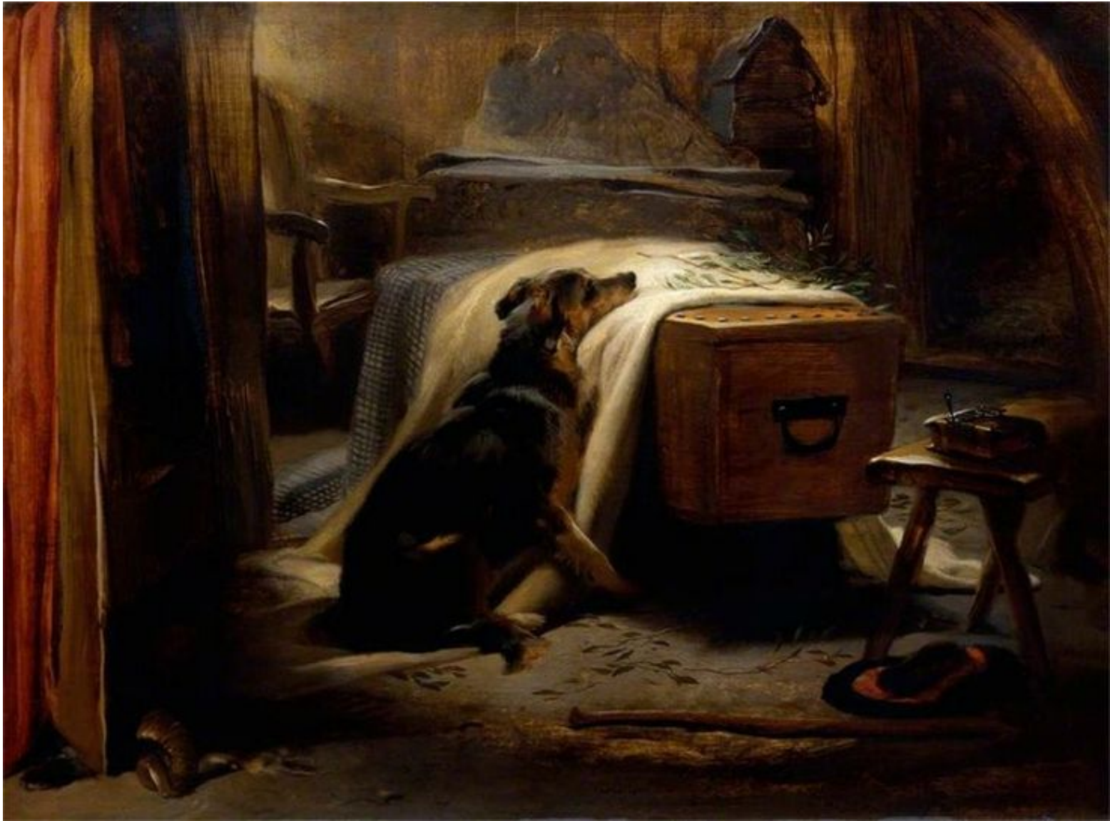
The Old Shepherd's Chief Mourner by Edwin Henry Landseer, 1837