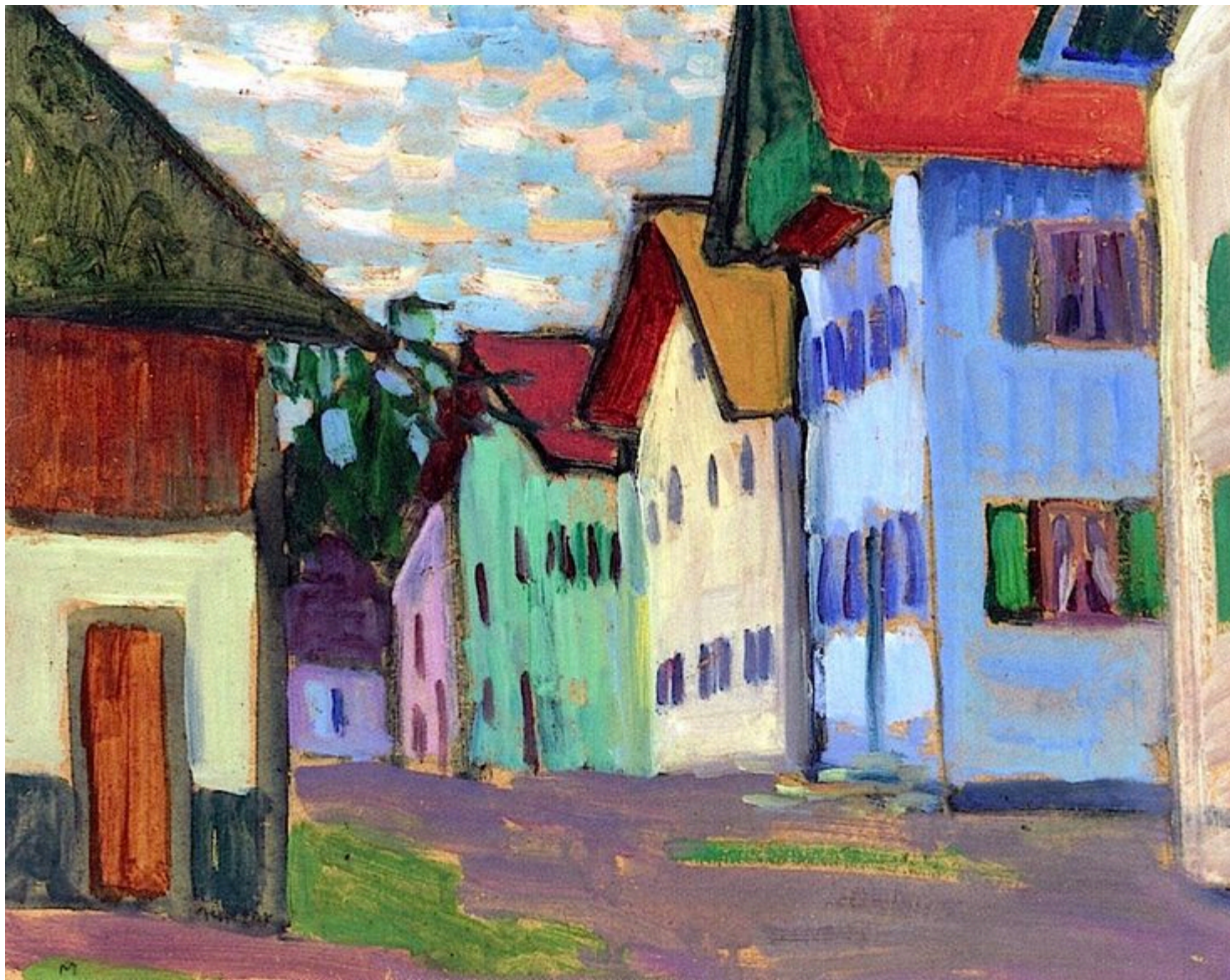
Alley in Murnau by Gabrielle Münter, 1908