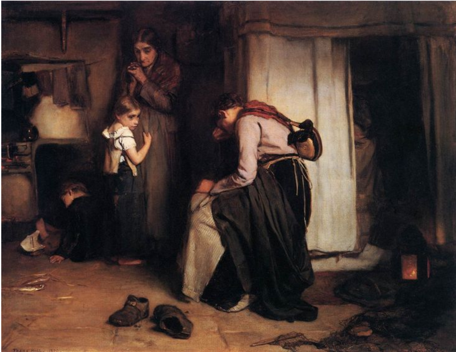
No Tidings From the Sea by Frank Holl, 1870