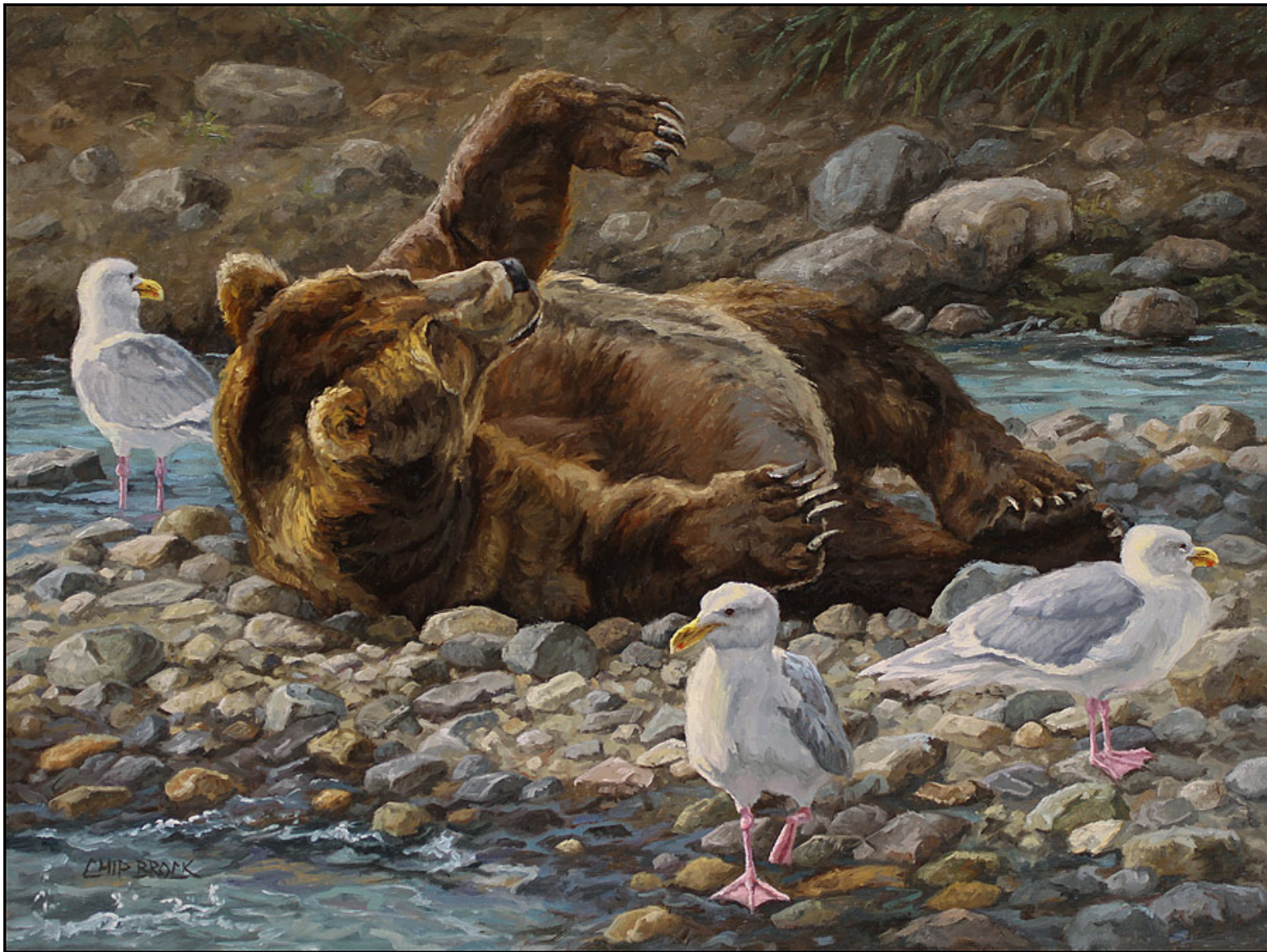
Too Drunk to Fish by Chip Brock