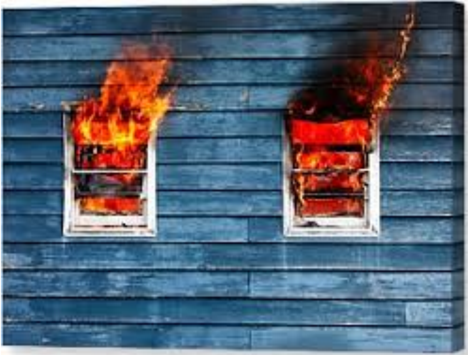
House on Fire by Todd Klassy