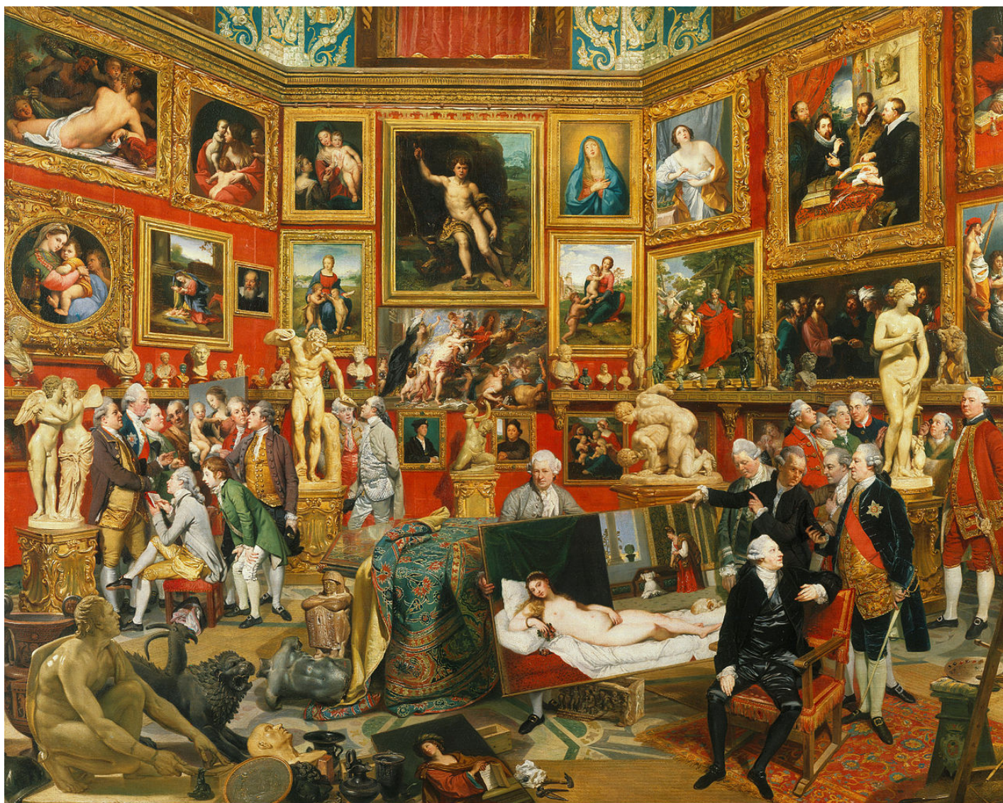
Tribuna of the Uffizi by Johann Zoffany, 1772-77