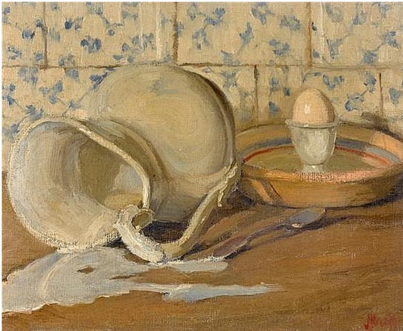
Spilt Milk by Margaret Rose Preston, 1903