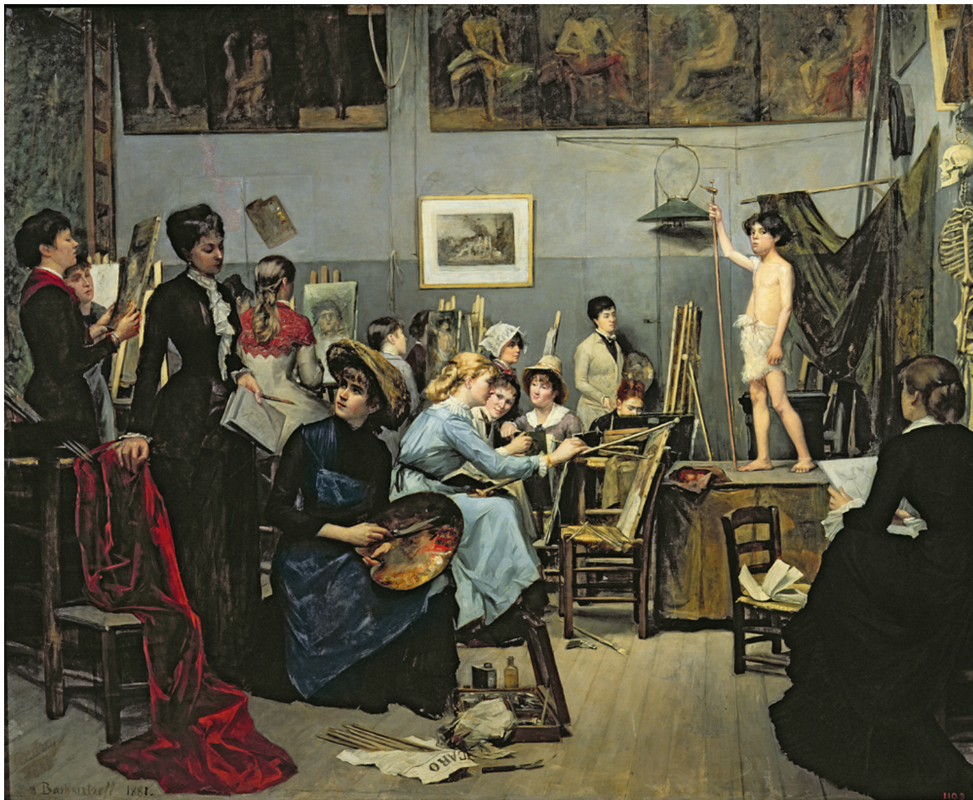
In the Studio by Marie Bashkirtseff, 1811