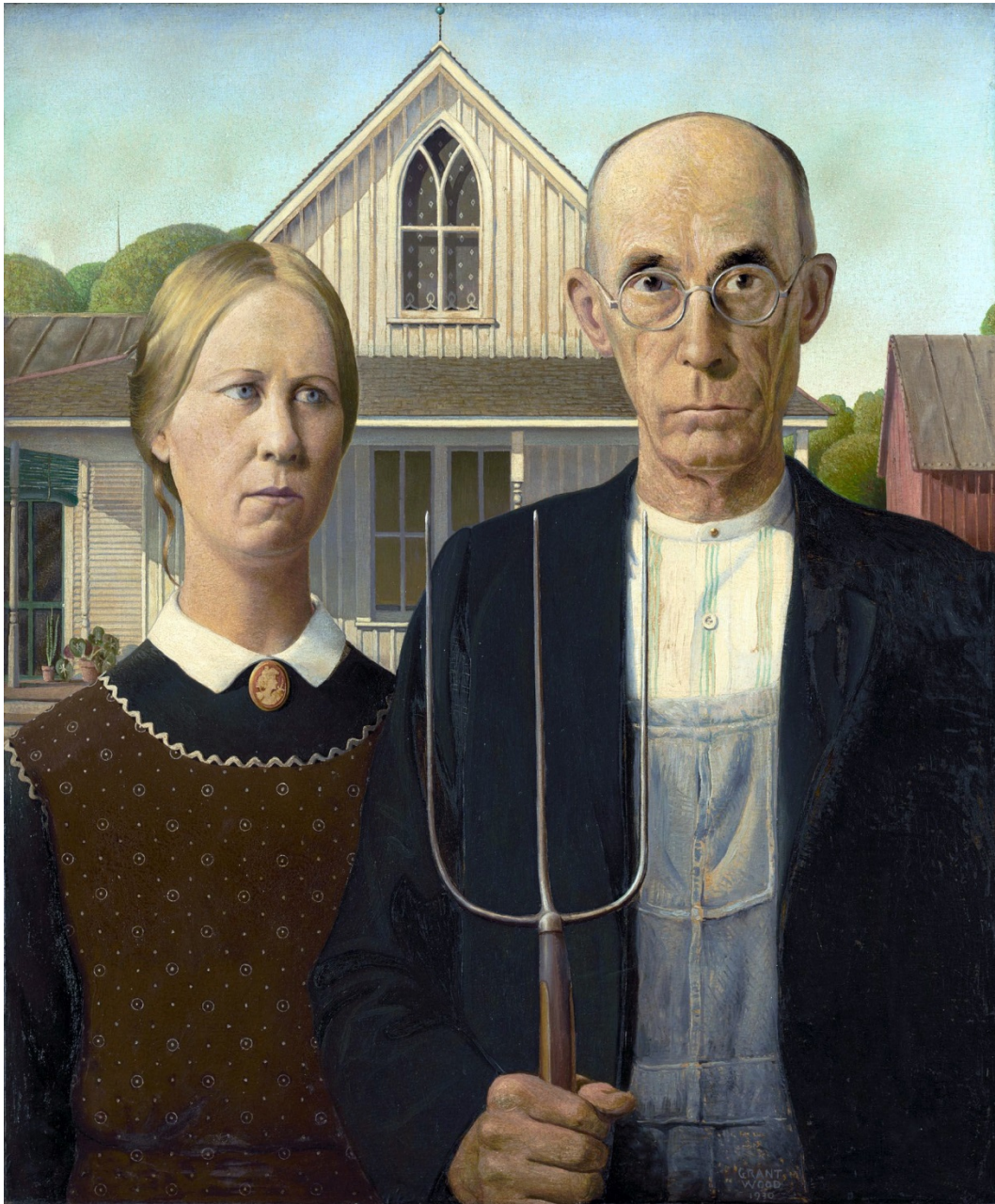
American Gothic by Grant Wood, 1930