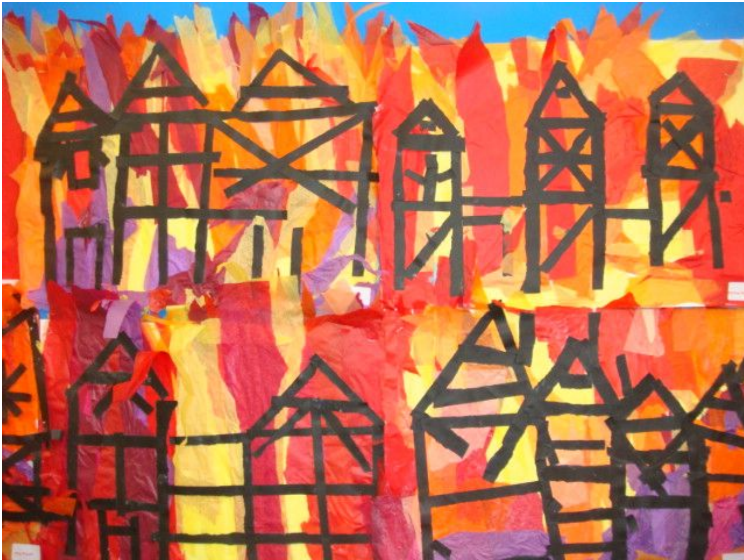
Great Fire of London by artist(s) unknown