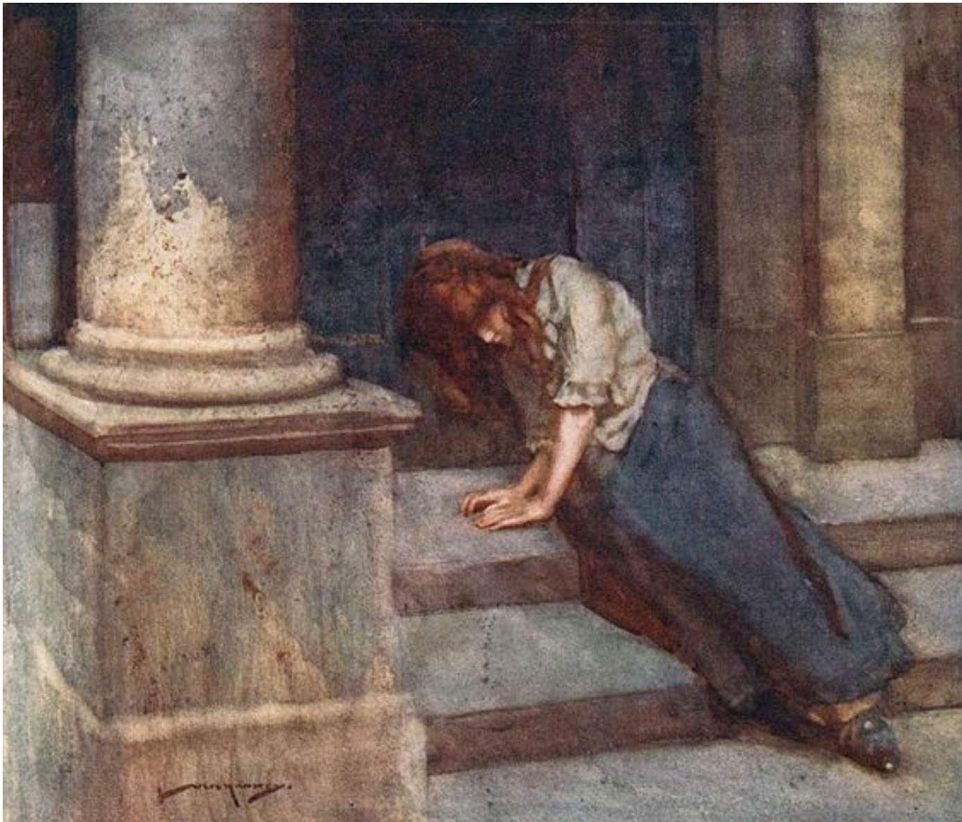
Illustration for "The Deserted Village" by William Lee-Hankey