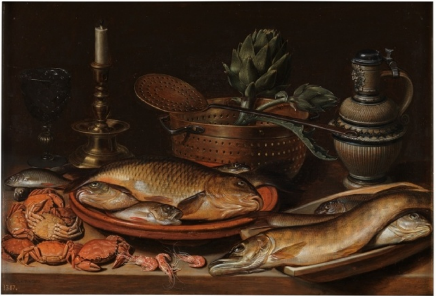
Still Life with Fish, Candle, Artichokes, Crabs and Prawns by Clara Peeters, 1611