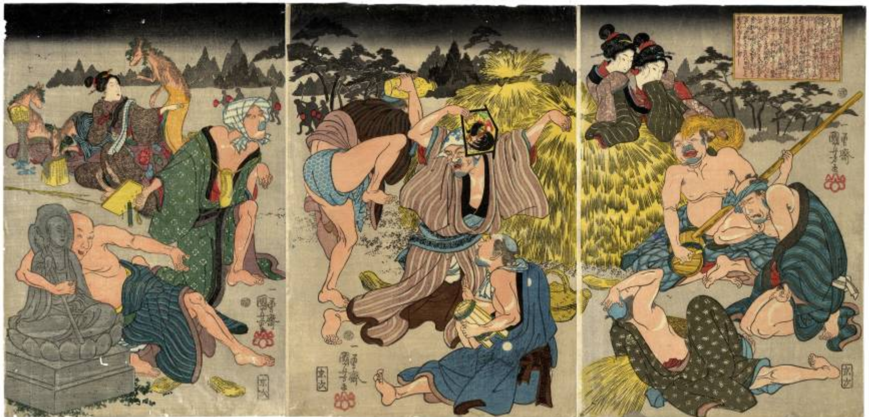
Triptych showing foxes drunk on sake by Utagawa Kuniyoshi (1797-1861)