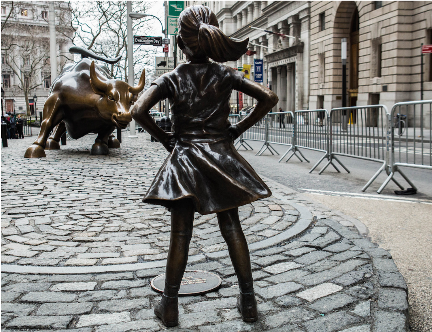
Charging Bull by Arturo Di Modica; Fearless Girl by Kristen Visbal