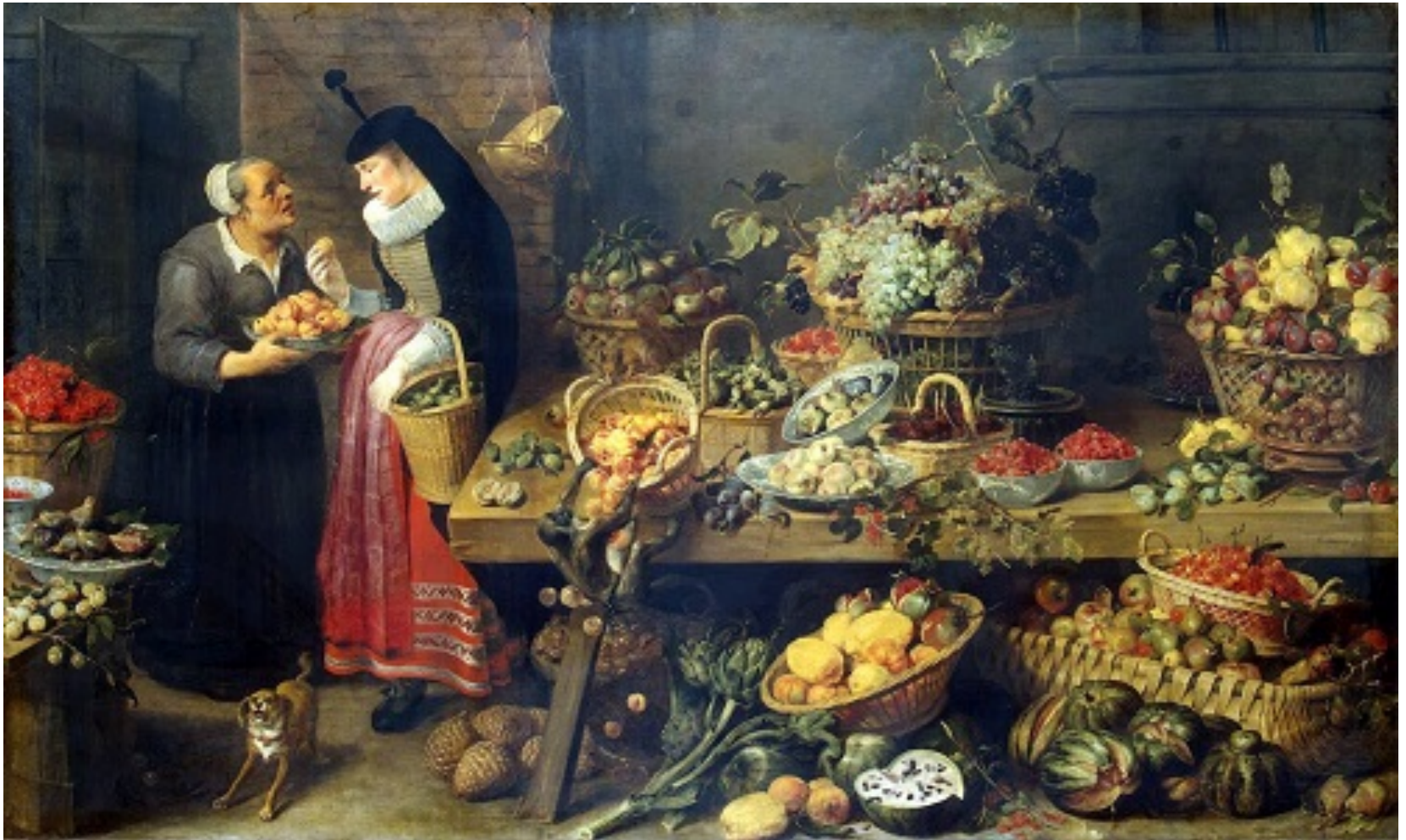
Fruit Stall by Frans Snyder, 1618-1621