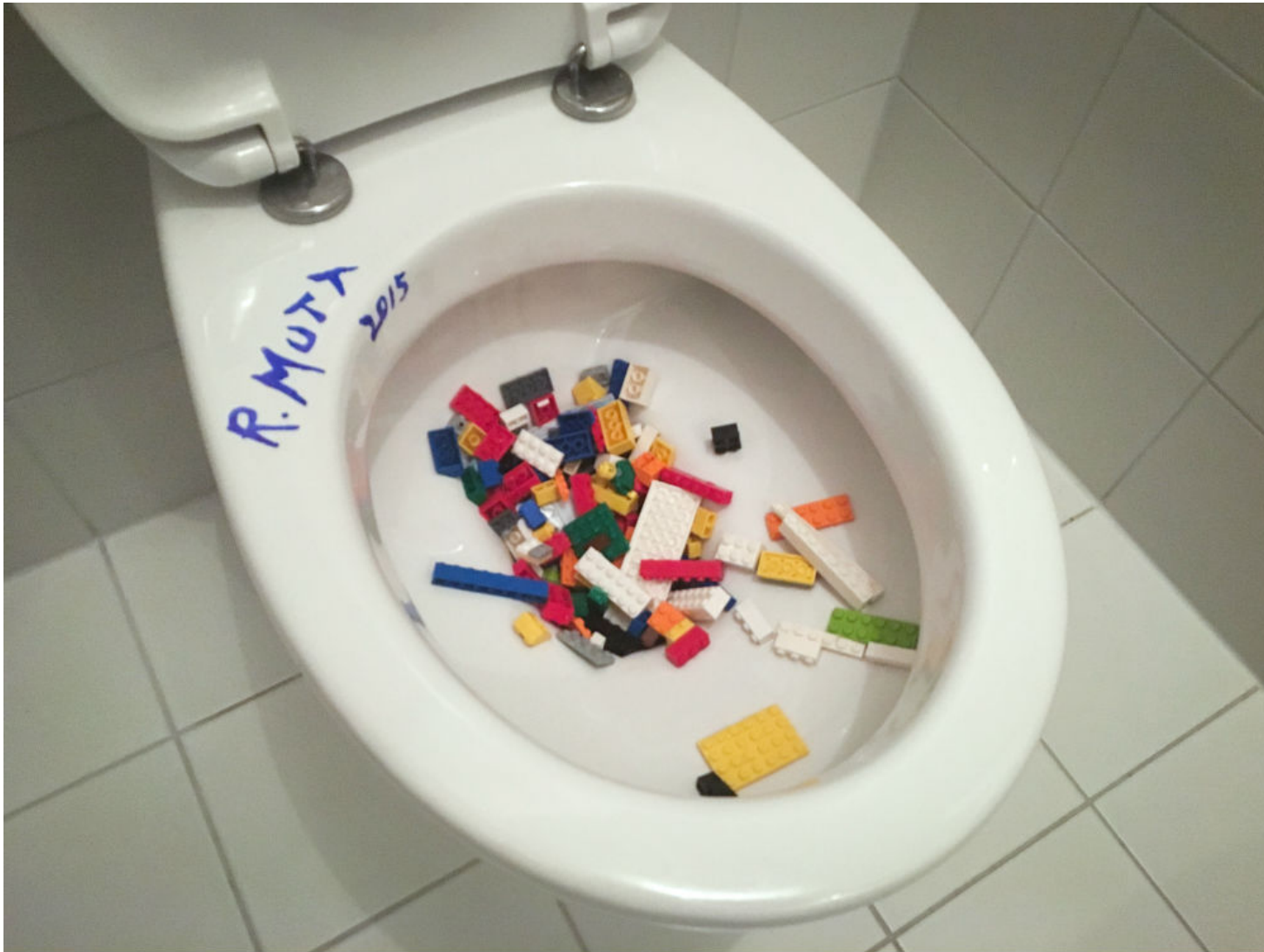
Letgo by Ai Weiwei, 2015