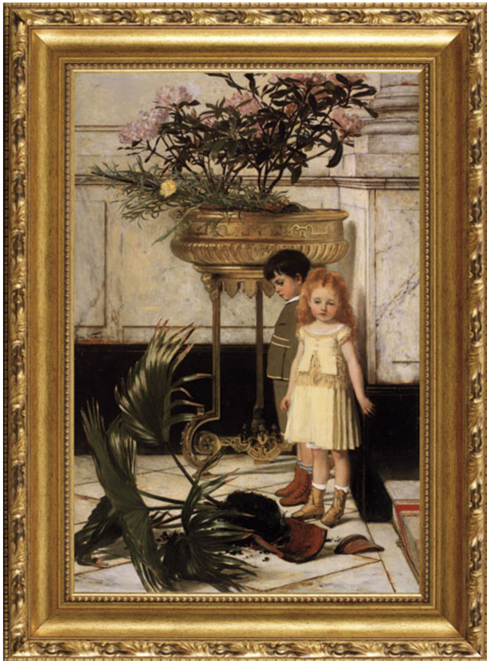
The Broken Flower Pot by Jan Verhas