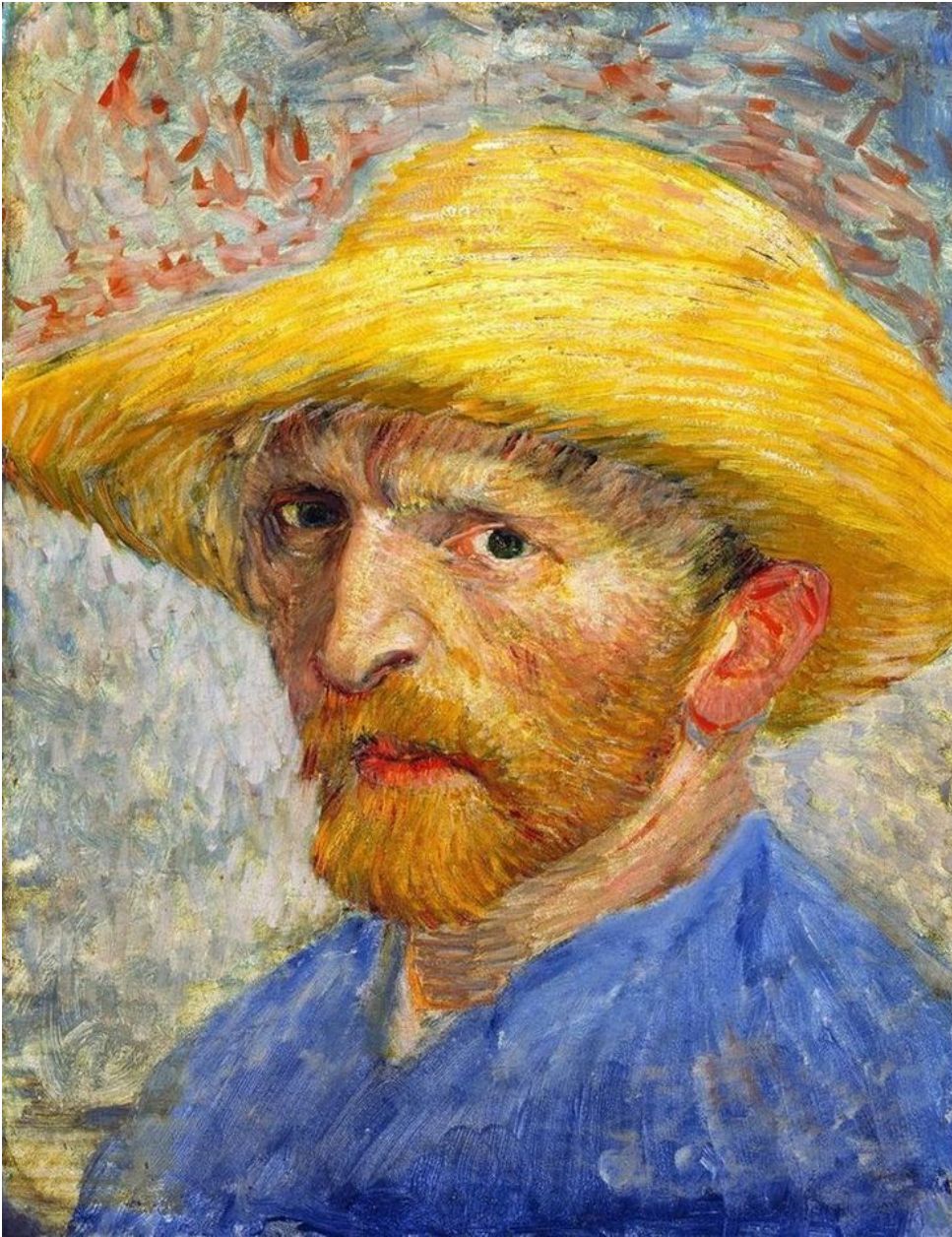
Self Portrait with Straw Hat by Vincent Van Gogh, 1887