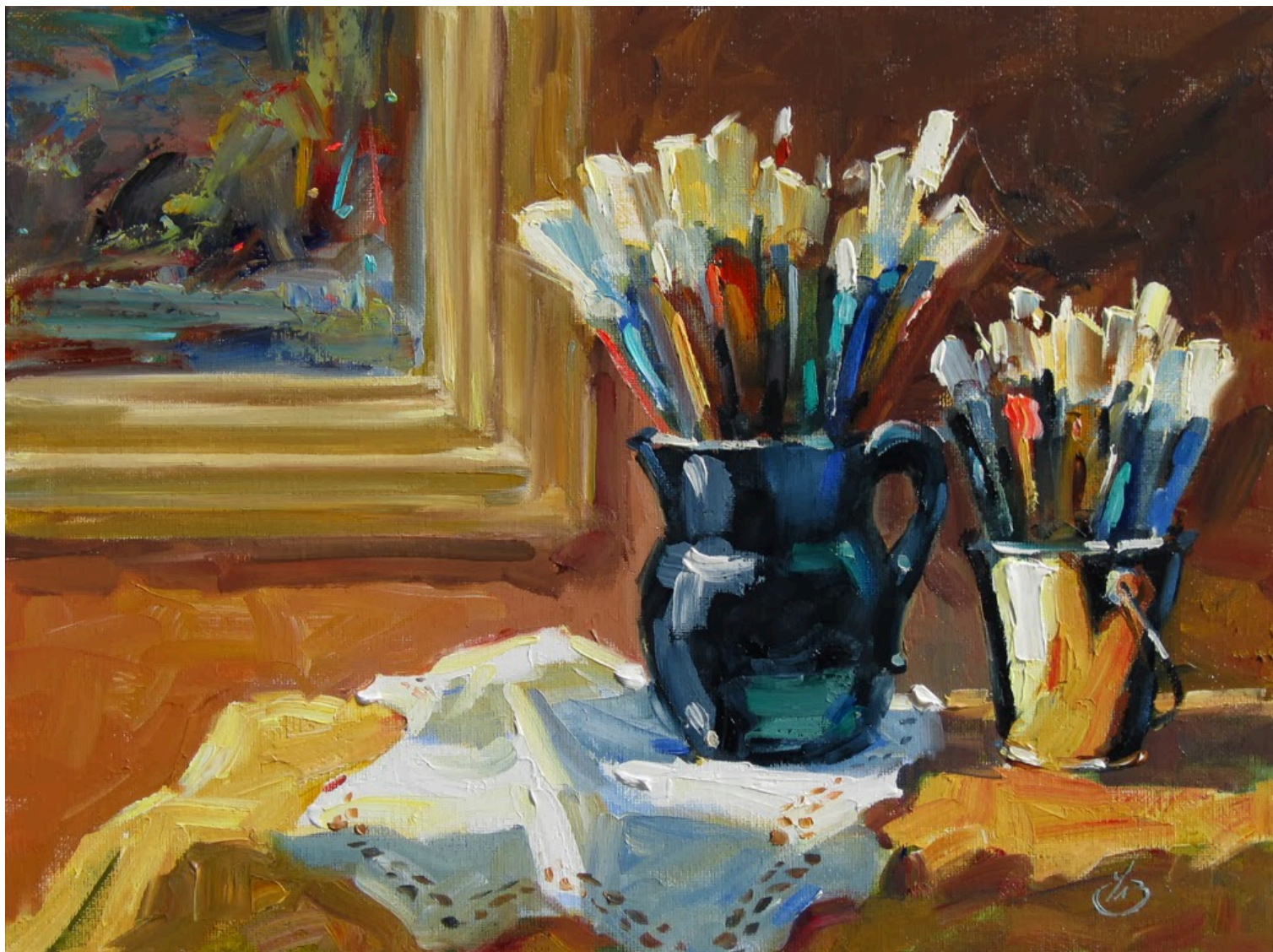
ARTIST'S STUDIO, BRUSHES, COLORFUL STILL LIFE by TOM BROWN